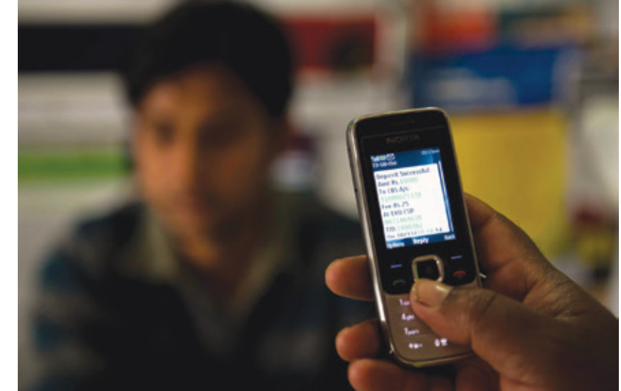
Afghani telecoms company Roshan automatically deposits a percentage of employees' salaries into mobile-based savings accounts.