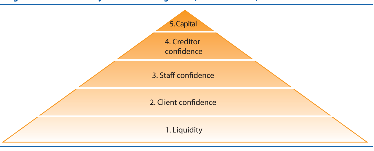
Figure 2: MFIs' Hierarchy of Needs During Crisis (Nod to Maslow)